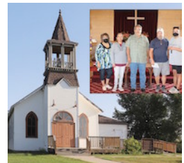
Flandreau Presbyterian Church, South Dakota, then and now.